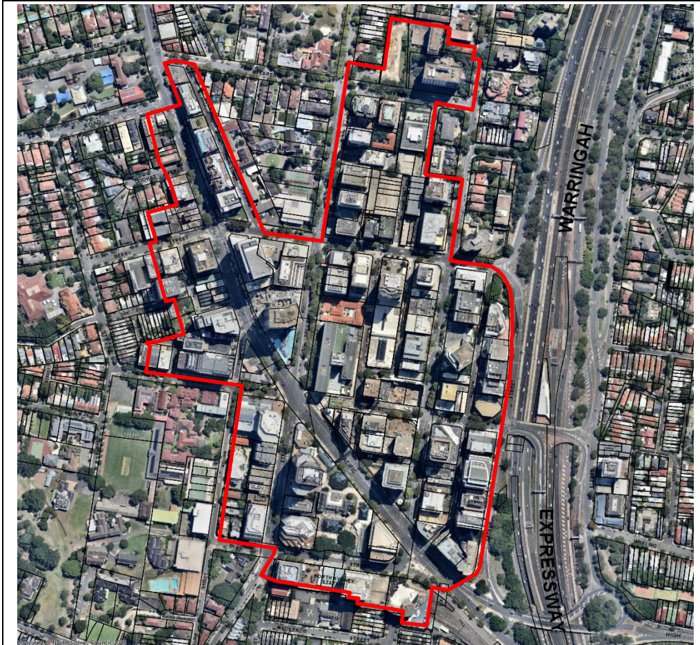
FIGURE 1: Aerial Photograph North Sydney Centre (outlined in red)